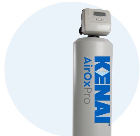
CPK-AIROXPROOZONE (with ozone)